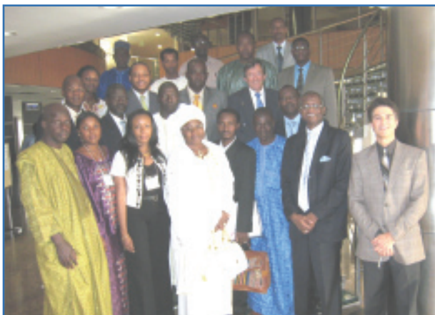
The Bureau du vérificateur général du Mali host the CCAF Governance symposium in 2008