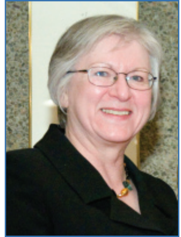
Sheila Fraser, Auditor General of Canada