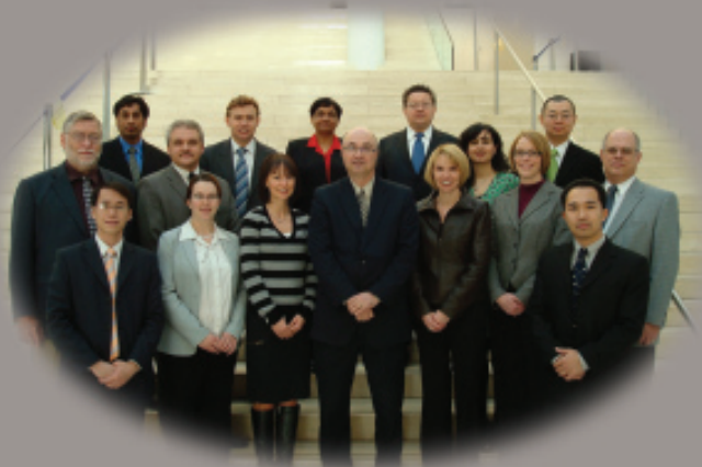
Office of the Auditor General for the City of Edmonton shares its experience with the two Fellows placed in Edmonton

With this range of partners, the Program provides Fellows with a comprehensive overview of audit issues at the federal, provincial and municipal levels. This is important because most national audit offices in developing countries are responsible for conducting auditing at all levels of government.