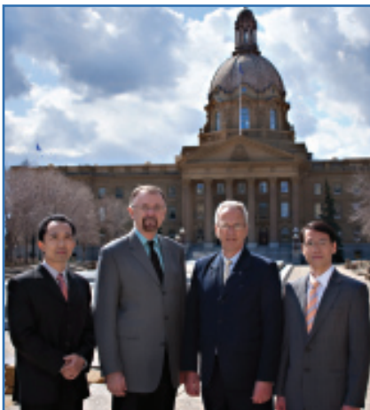
Vietnam Fellows study term with the Office of the Auditor General of Alberta

In 2008-2009, seven Fellows graduated – one each from Ghana , Kenya , Saint Lucia , Guyana and Thailand , and two from Vietnam . The Fellows from Vietnam did their placements at the Office of the Auditor General of Alberta, and the others at the Office of the Auditor General of Canada.