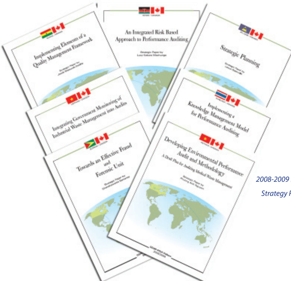
2008-2009 Fellows' Strategy Papers

To ensure their studies in Canada have a strong practical focus, each Fellow is required to develop a Strategy Paper on a topic that has been approved in advance by their home office. Upon their return home and with the support of their office, the Fellows are required to implement the strategy set out in their paper.