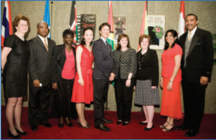
Ghana, Guyana, Kenya, Saint Lucia and Thailand Fellows complete their placements at the Office of the Auditor General of Canada