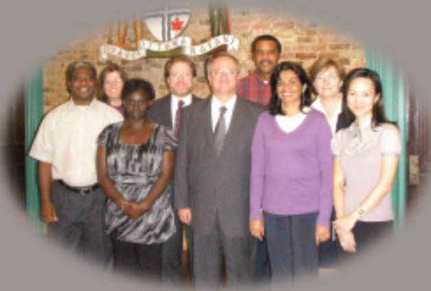
Office of the Auditor General for the City of Ottawa shares its experience with the five Fellows placed in Ottawa