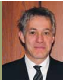
Renaud Lachance, Auditor General of Québec 2004-11