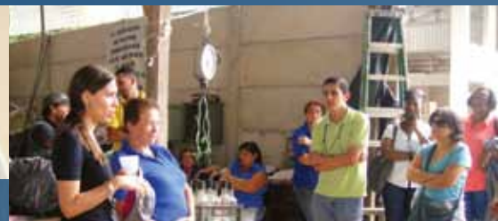
Participants visit a recycling facility during the CCAF environmental auditing workshop in Costa Rica in February 2011.

Graduate Fellows and their colleagues played key roles in the process of developing, testing and delivering the Spanish CCAF-IDIAG workshop.