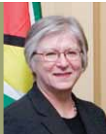
Sheila Fraser, Auditor General of Canada 2001-11