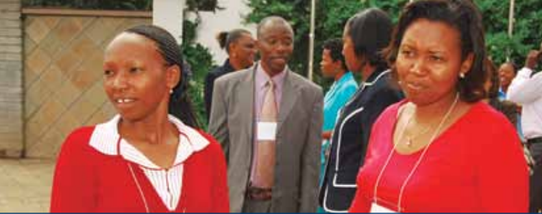
Women and men participate as equals in workshops and the Fellowships.